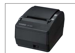
Casio UP-400 Ethernet RS232 Printer