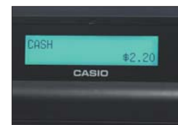
Built-in 2 x 20 Customer Display