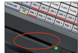
Magnetic Stripe Reader